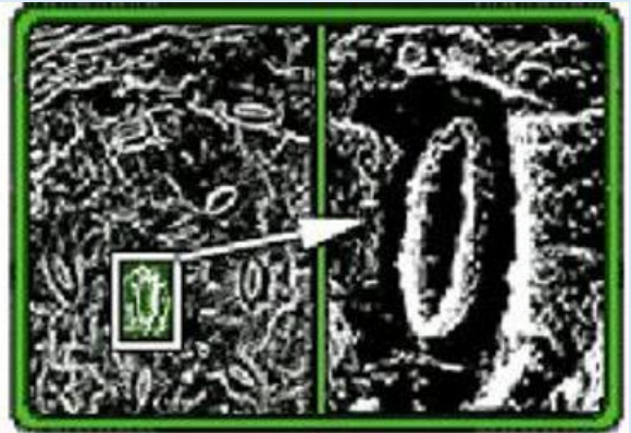
Treated with Sonic Bloom